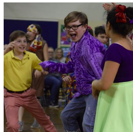
Griffin is ready to dance!